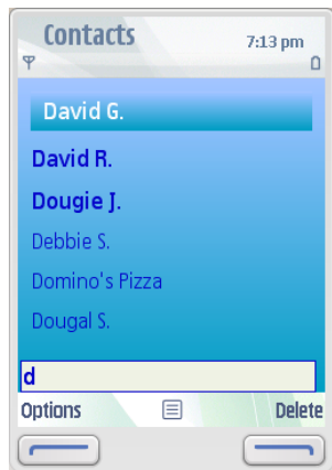
Figure 4. Hybrid one-dimensional mapping of importance (important items are highlighted in bold but ordered alphabetically so as to maintain user familiarity with existing UIs).

We believe that our technique as described above can be very useful in order to build rich singular, two or three-dimensional information retrieval interfaces that will support data from multiple information repositories and present them in context, as demonstrated in the mock-ups presented in this paper (figures 4 & 5).